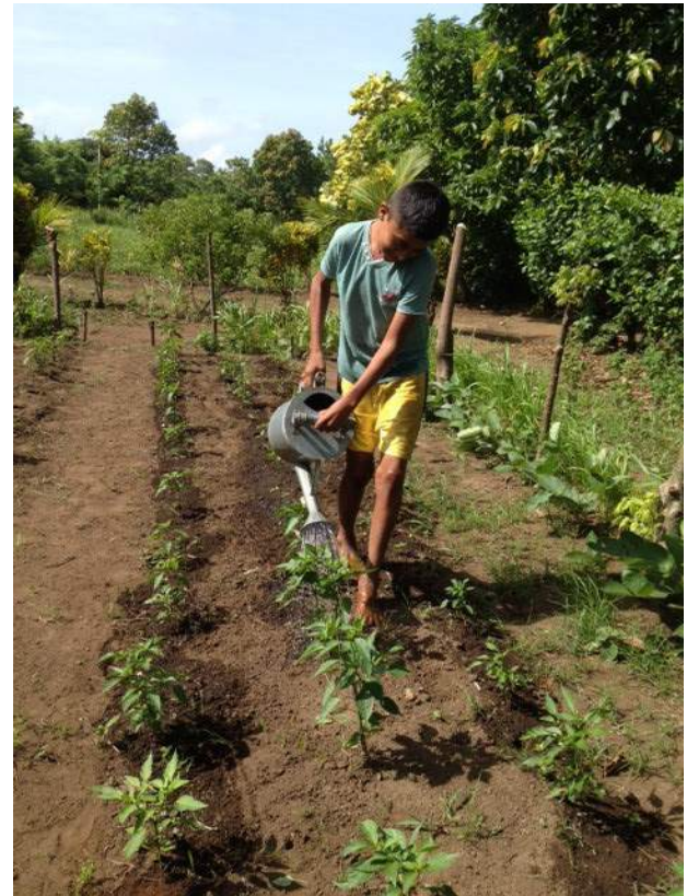
Above, a community member waters crops at the UCA Tierra y Agua cooperative in La Granadilla.

Above, each garden has between 3 and 5 plots that measure 8 metres by 120cm. Intern Sinéad was able to watch and assist one morning in the creation of 5L of binadre , or organic fertilizer, a process which took 3 hours of labour on the part of 6 people, and then 5 more hours of patience as they waited for it to collect.