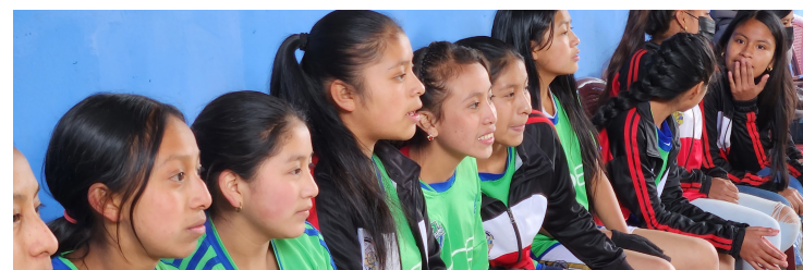
The girls' soccer team

While your financial support has kept the school doors open, your moral support has kept me going. I want to thank you for both.