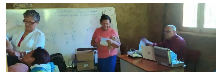
Christine King Cooperative provides alternative health care services to Jiñocuao community members

Some exchanges involve providing services to community members. The Christine King Cooperative has travelled to several communities, including Jiñocuao, to provide natural medicine services (a program Casa contributed to last year). In some communities they also provide some training to local health-care professionals.