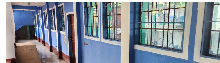
El Triunfo School with new windows and blue paint

On my visits to the school, I was pleased to notice that the building was back in a good state of repair. Broken windows in the classrooms were fixed and a new bright blue paint job was in the process of being finished. In addition to taking part in the festivities, I was also able to meet with the school and community leaders and get caught up on the paperwork. Thank you for your continued and valued support; the running of the school is not possible without it.