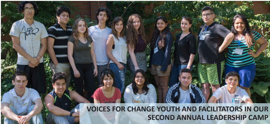
VOICES FOR CHANGE YOUTH AND FACILITATORS IN OUR SECOND ANNUAL LEADERSHIP CAMP

YEAR 2 OF 'VOICES FOR CHANGE' ENDED WITH A BANG THIS SUMMER! THIS IS WHAT WE ACHIEVED AND WHAT IS COMING UP IN YEAR 3